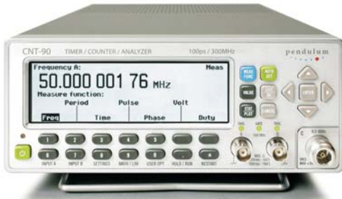
Figure 2: Measure function selection menu, shown with measured results.