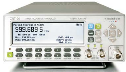
Figure 4: Display showing different statistical parameters viewed at the same time.