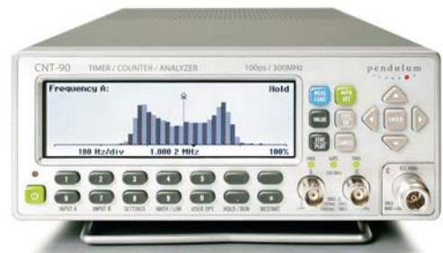
Figure 6: The same result as in figure 5, now displayed as a histogram.