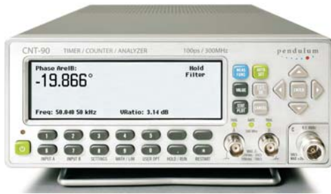
Figure 1: Display showing phase value, frequency, attenuation V_A/V_B , and auxiliary parameters.

When adjusting a frequency source to given limits, the graphic display gives fast and accurate visual calibration guidance.