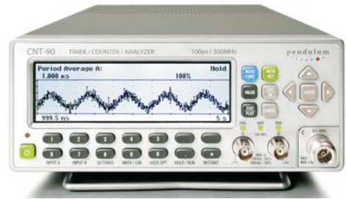
Figure 5: Display showing the trend (signal over time) of sampled data.