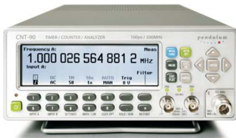
Figure 3: Input parameter setting menu shown with measured result.